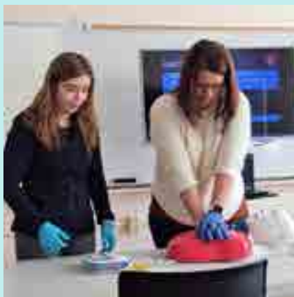
Heartsaver First Aid/CPR/ AED Certification