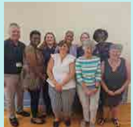
Certified Nursing Assistant (C.N.A.)