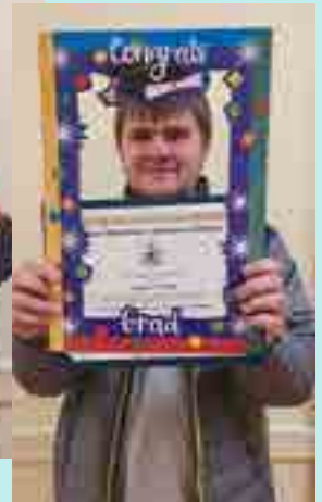
HiSET (High School Equivalency Test)