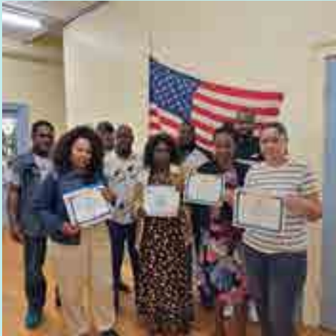
English Language Learners pg 20