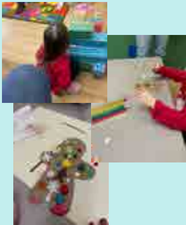
Family Literacy pg 18